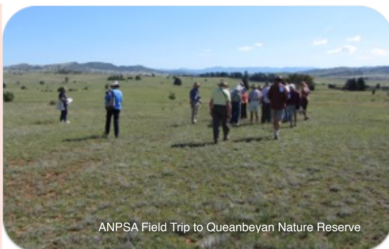
ANPSA Field Trip to Queanbeyan Nature Reserve