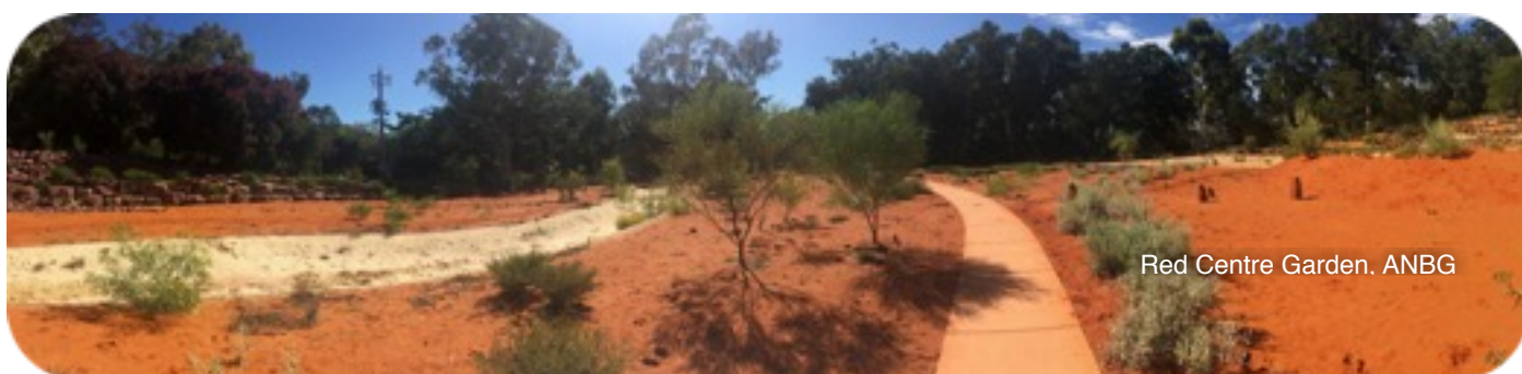
Red Centre Garden, ANBG