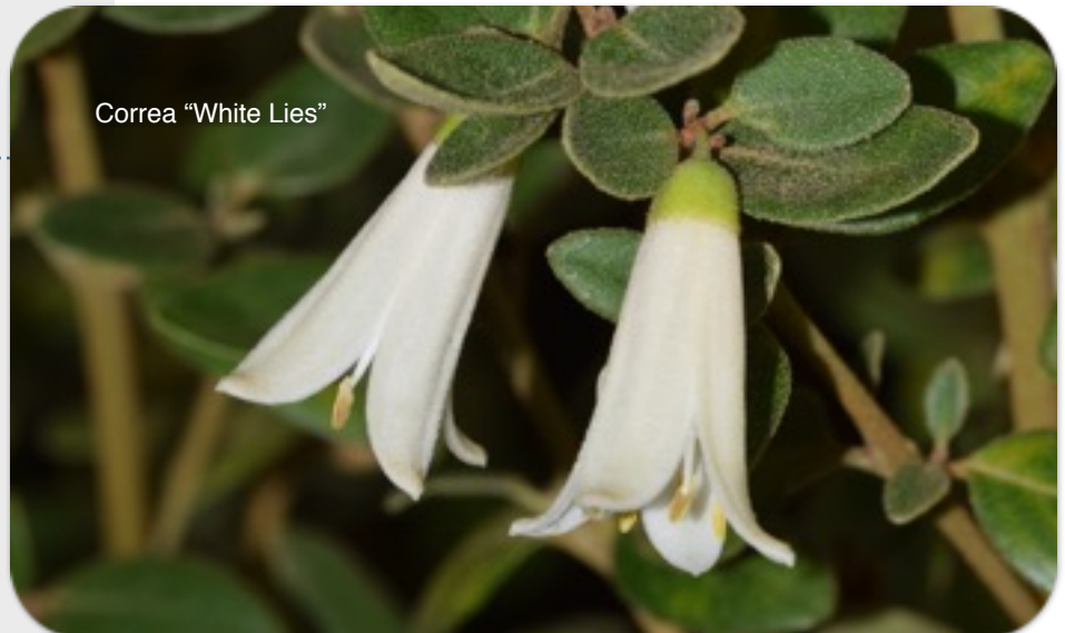
Correa "White Lies"

www.anbg.gov.au/acra/application-form/acra-form.pdf