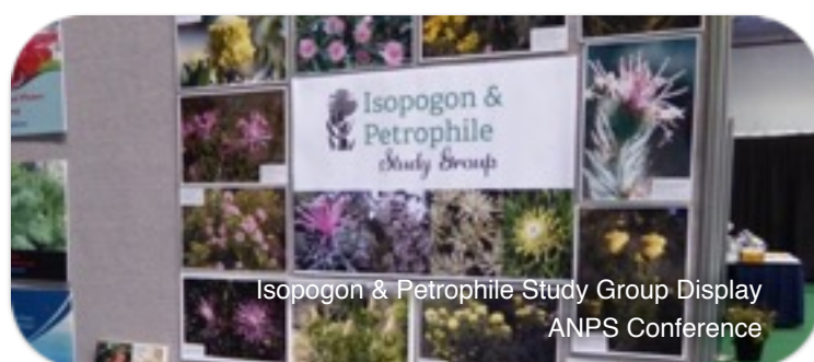
Isopogon & Petrophile Study Group Display ANPS Conference