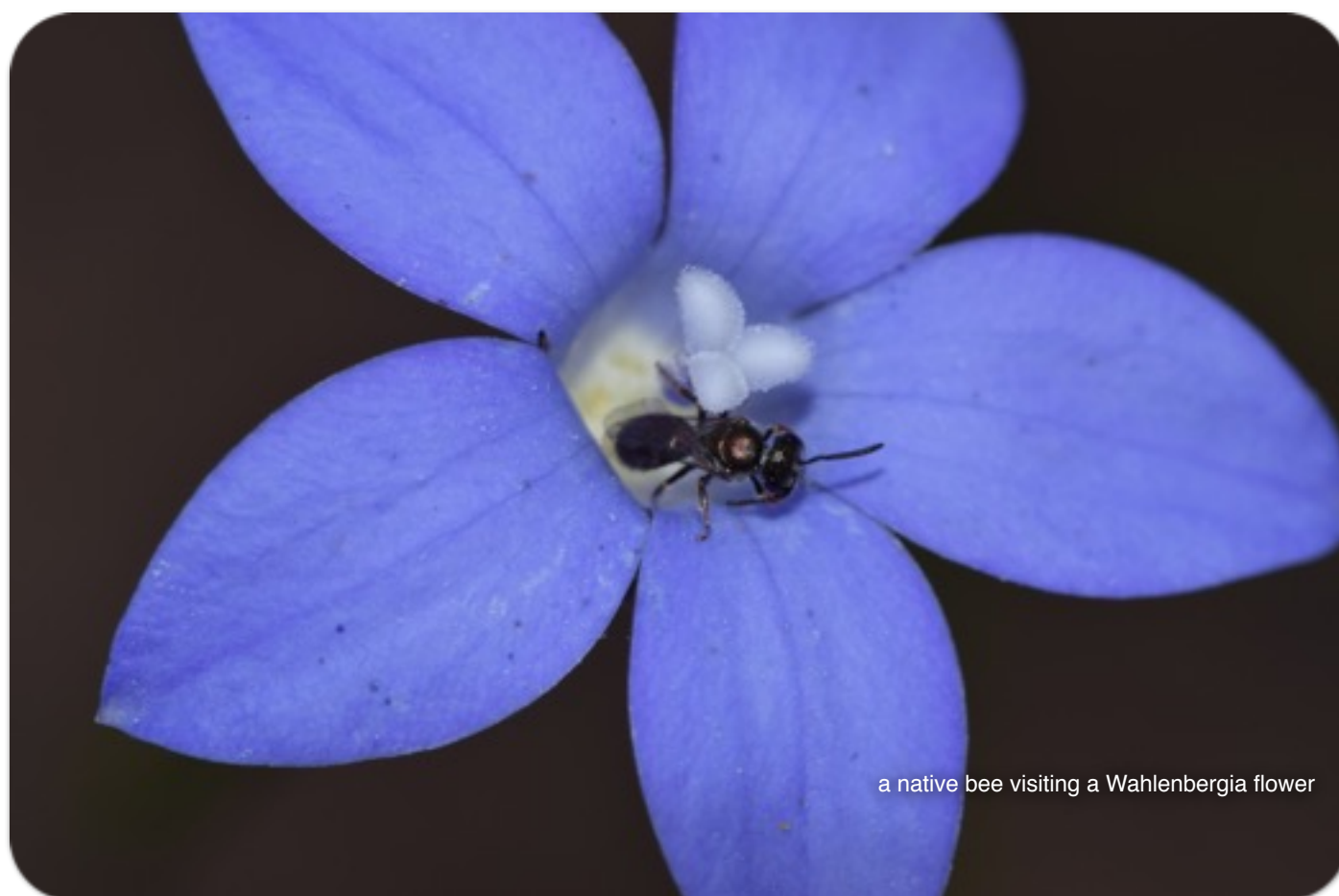
a native bee visiting a Wahlenbergia flower