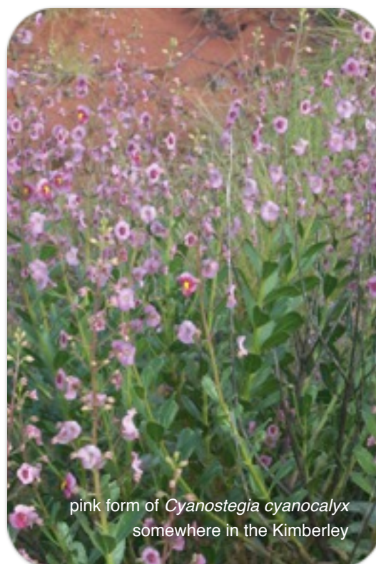
pink form of Cyanostegia cyanocalyx somewhere in the Kimberley