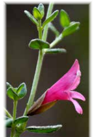
Prostanthera calycina (Ben Eaton)

Sunday 25 October, 2020 Coach Tour – Garden Visits