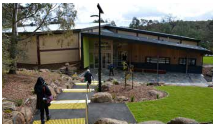
The Eltham Community & Reception Centre Entrance (Ben Eaton)

The main hall (the Dorian LeGallienne Room) seats up to 300 people for the day proceedings and up to 160 for the Evening dinner. It has full disability access to all areas. Lunch and teas will be available in the Atrium (outside the main hall), and there are plenty of places to eat both within and outside the venue depending on the weather.