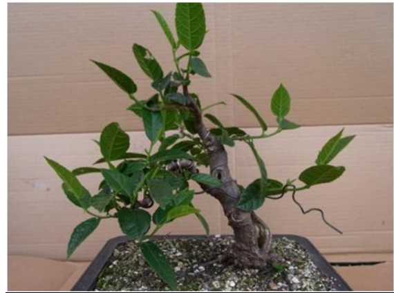
Figure 4. March 2011 and the new branch is being allowed to grow wild while the other growth is being maintained.

16 months after training started the tree had developed into a very presentable bonsai (Figure 5). Although the two lower branches are in close proximity, there is just enough of an offset, plus the different growth directions, to miss 'bar branching'. A Penny Davis Mudlark Bonsai Pot sets the tree off superbly. Fresh wiring has corrected some branch