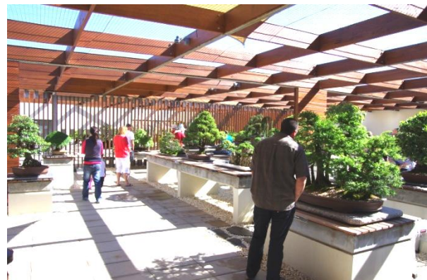
Figure 1. NBPCA’s new exhibition space, April 2013.