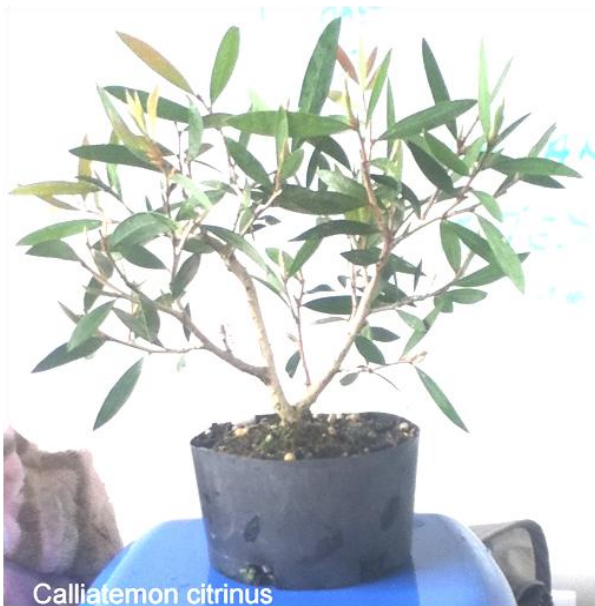
Figure 1. Callistemon citrinus .

Examples of other species were quickly added to the work in process; Callistemon citrinus (Figure 1), Melaleuca fulgens and the good old Ficus rubiginosa to name a few. I liberated a few trees from the "Please Give These Trees a Good Home" area in the