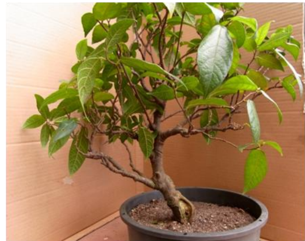
Figure 1. Sandpaper fig acquired 10 September 2010 – Bonsai Society of Australia Marketplace.

Occasionally at bonsai club sales you can pick up interesting stock as in Figure 1.