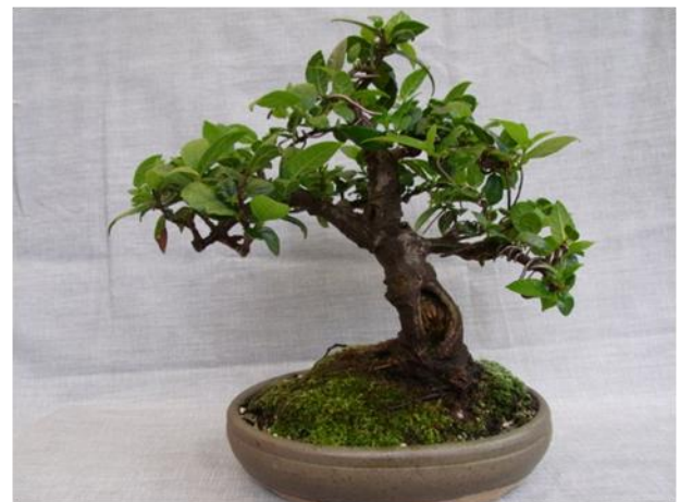
Figure 5. 16 months after training start.

16 months after training started the tree had developed into a very presentable bonsai (Figure 5). Although the two lower branches are in close proximity, there is just enough of an offset, plus the different growth directions, to miss 'bar branching'. A Penny Davis Mudlark Bonsai Pot sets the tree off superbly. Fresh wiring has corrected some branch