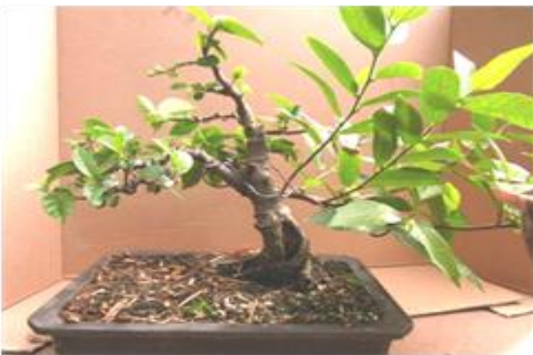
Figure 3. December 2010 and note the new branchlet lower right – exactly where it is needed.

Three months later, you have the tree in Figure 3.