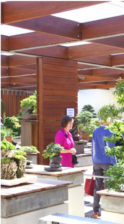
Figure 2. Beautiful trees in beautiful places.

much further afield that made much longer treks too, from Perth, Hobart, Adelaide, Melbourne, Brisbane, and many smaller centres as well. Once the ribbon was cut, once for the Arboretum and ACT Government, and once for the bonsai community, the public streamed-in by the hundreds. The flow has not stopped, and it is now nearly 5 months since opening.