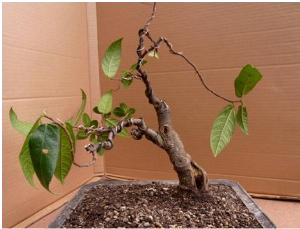
Figure 2. 10 September 2010 two hours after purchase.

Excess growth was removed and shaping started (Figure 2.). Then it was potted in good soil and left to contemplate the pains of care and get started on its new life.