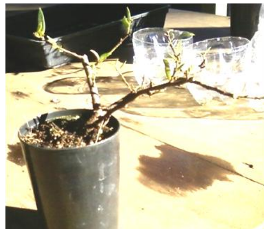
Figure 2. Eremophila maculata x alternifolia .

Somehow I think that I've also 'confirmed' local Australian Plant Society knowledge that soft wood cuttings go better than hard wood when striking Eremophila maculata using