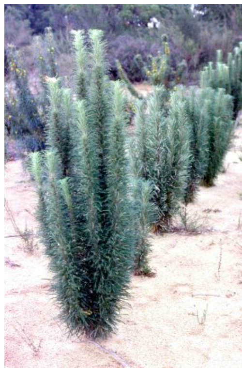
The appropriately named new species D. columnaris in 1988

Margaret visited the plantings on at least four occasions, the last in 2006 when we launched the Dryandra book. Thanks largely to Keith's collecting activities, we were growing and flowering many of the new and unnamed species well before they were named.