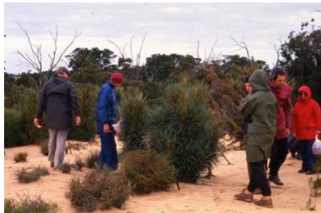
Study Group members June 1990 Margaret

Losses were around 5% and some species like D. nobilis had taken a real liking to the place. I have include a series of pictures from these early days so you can see for yourselves what it was like and how the plants progressed. Regrettably, I took very few pictures of the people involved and we don't even have a decent picture of Alf.