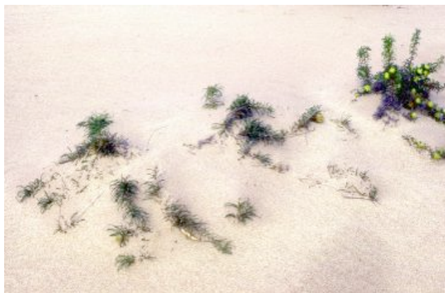
D. fraseri in 1985

drums and then swamped the plant inside. We were only successful with prostrate species in protected areas.