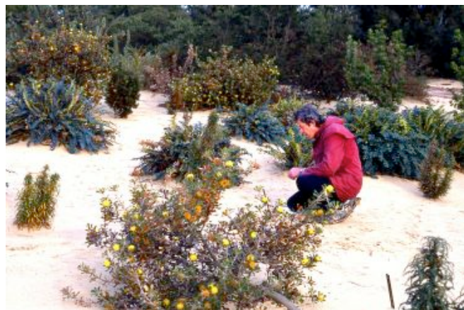
In its heyday, July 1990

that they were being replaced by many seedlings. Of course, the worst problem was that we were losing specific and rare plants and could do nothing about it. But as my NL71 article showed, eventually the "weediness" of these proteaceous genera forced the hand of the staff and now the only dryandras you will eventually find at Cranbourne will be in garden plantings.