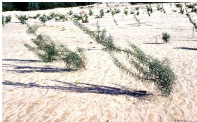
D. squarrosa in 1986