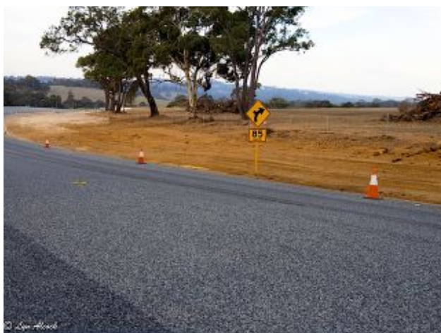
The road today Lyn Alcock

Dryandra praemorsa var. splendens is not as common as var. praemorsa which always has lemon yellow flowers. It has larger leaves and flowers and the reason for its variety name ' splendens ' is because of the range of shades of pink in the flowers. In the destroyed population there were plants with flowers ranging from pale yellow to deep pink.