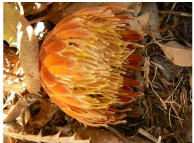
D. proteoides at Banksia Farm, June