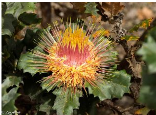
Deep pink form of D. praemorsa var. splendens Lyn Alcock

The Dryandras are all from this population. This is the type location for this taxon. It was described from a specimen collected there.