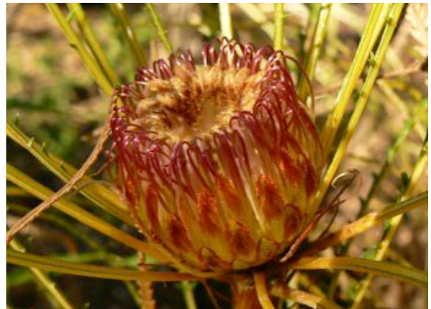
D. nivea ssp. uliginosa at Banksia Farm, June