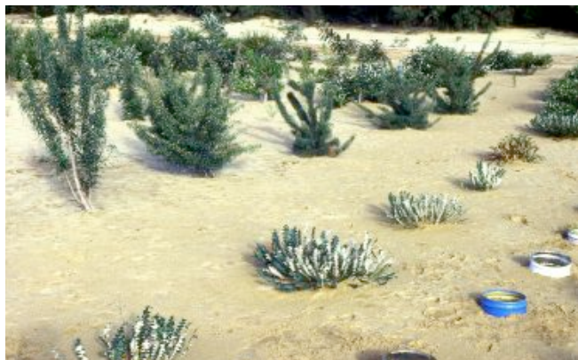
Plantings in 1984 showing drum experiment TC

By the early 1990s, we had perhaps 1300 to 1500 plants in some 90 taxa but two major problems were emerging. Cinnamon fungus Phytophthora cinnamomi was found in the Special Collections and had a devastating effect on the Western Banksia plantings and some parts of the Dryandras, especially along water run offs and lower lying areas where losses were eventually nearly 100%. Secondly, some species were showing an unhealthy tendency to weediness with multiple seedlings of D. squarrosa , D. cuneata , D. nobilis and even D. falcata appearing throughout the old planted areas. See my article in NL 71 for more details but I should add that dryandras weren't the only culprits; some Isopogons, Petrophiles, eastern Banksias, Persoonias and even Lambertias spreading from the Special Collections into the surrounding bush. The worrying aspect of the first was that it seemed to be mainly the older shrubs being affected and it was heartbreaking to see 2-3m, 15 year old shrubs dying. We wondered whether it was due to the roots of these large plants having reached contaminated water but I, initially at least, took heart in the fact