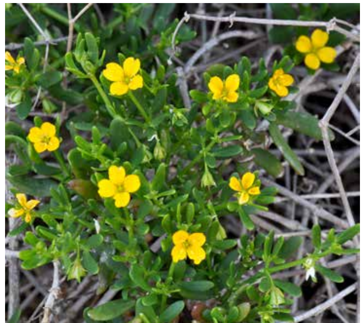
Roepera billardierum . Syn. Zygophyllum billardierum .