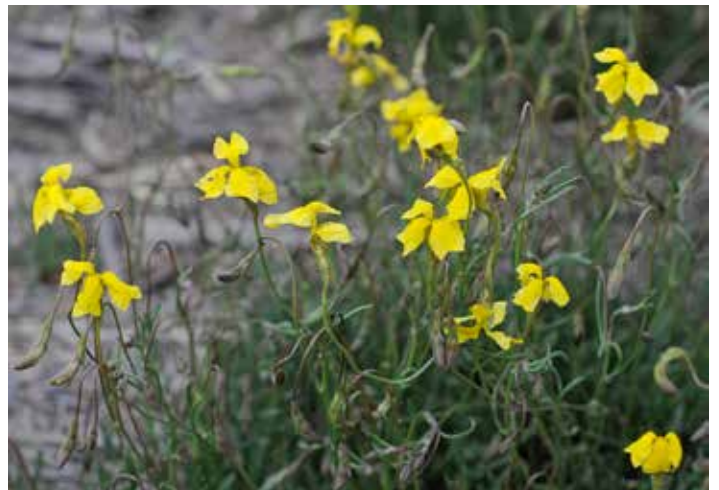
Goodenia pinnatifida .

A walk through the grassland reveals a remarkable diversity of species of varying textures and colors which includes beautiful daisies such as Minuria leptophylla , Leucochrysum albicans var albicans , Rhodanthe anthemoides and swathes of Chrysocephalum . Other feature plants include the tall Mulla Mulla, Ptilotus macrocephalus , Goodenia pinnatifida and Arthropodium minus .