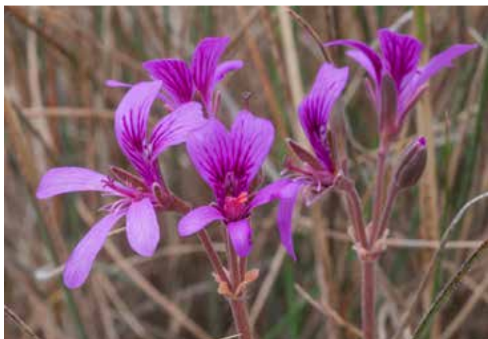
Pelargonium rodneyanum .