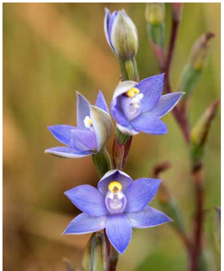
Thelymitra arenaria .

Walking quietly and looking closely reveals many resident pollinators. When managed well, our grasslands can be very diverse ecosystems with flowers, herbs, lillies and orchids as well as a variety of grasses and people on this excursion will have the rare opportunity to see and hear about what is being done to preserve and protect the remaining remnants.