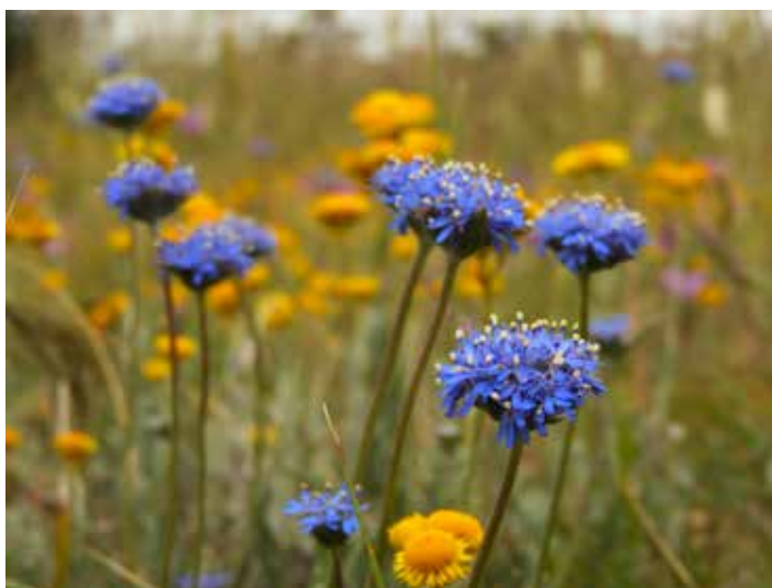
Brunonia australis .

A walk through the grassland reveals a remarkable diversity of species of varying textures and colors which includes beautiful daisies such as Minuria leptophylla , Leucochrysum albicans var albicans , Rhodanthe anthemoides and swathes of Chrysocephalum . Other feature plants include the tall Mulla Mulla, Ptilotus macrocephalus , Goodenia pinnatifida and Arthropodium minus .