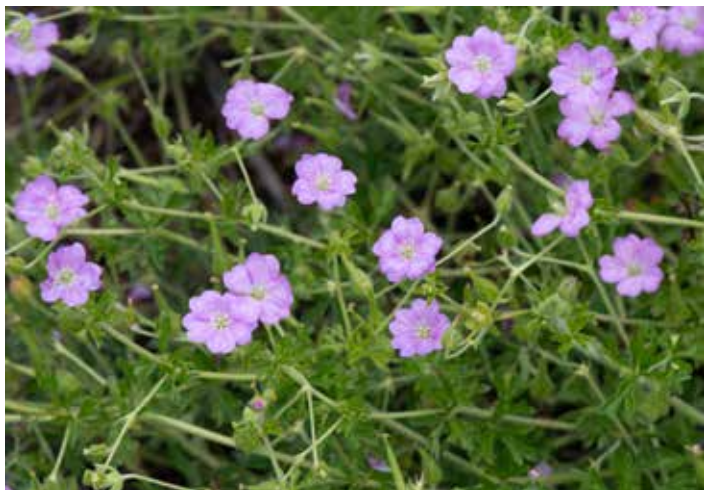
Geranium sp. 1.

The reserve is a Themeda dominated grassland and home to a large population of Striped Legless Lizards ( Delmar impar ). Over the last 30 years a grassland infested with Serrated Tussock has been slowly transformed into a superb example of the original flora. Staff and The Friends of Iramoo volunteers have shifted the balance towards a Themeda triandra system and reintroduced rare species such as Pimelea spinescens subsp spinescens , Rutidosis leptorhynchoides , Geranium sp 1 and Podolepis linearifolia .