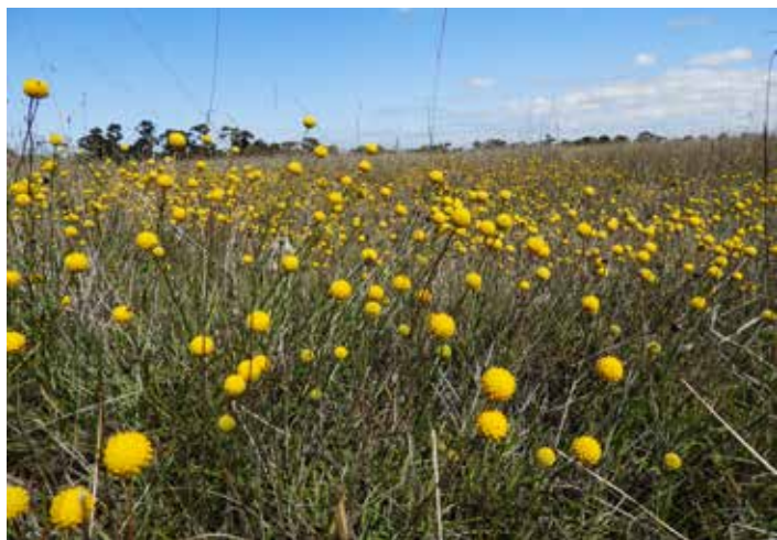
Fields of Gold.

Less than 2% of Victoria's grasslands remain intact and some of the best and most diverse examples are on the outskirts of Melbourne. Our Grasslands excursion will include the Evans Street Grasslands in Sunbury and Iramoo at the Victoria University which are two of the best examples of original grassland flora of the Keilor basalt plains. The Victorian volcanic plains grasslands were described as fields of gold by the first waves of