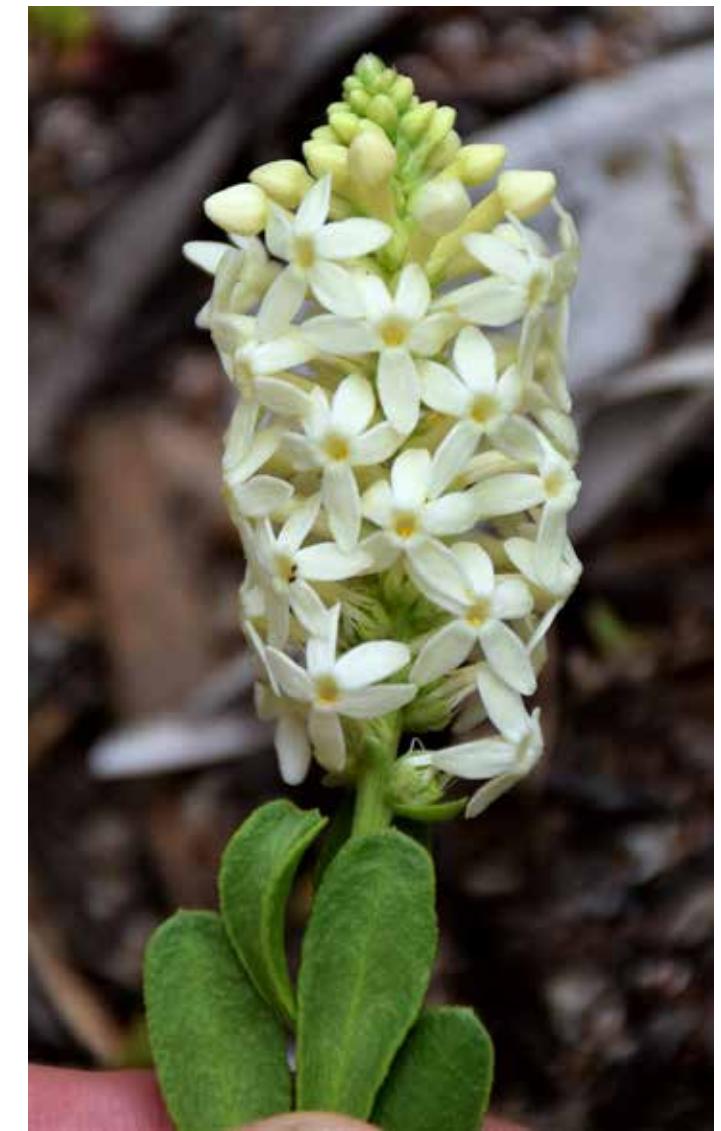
Stackhousia spathulata .