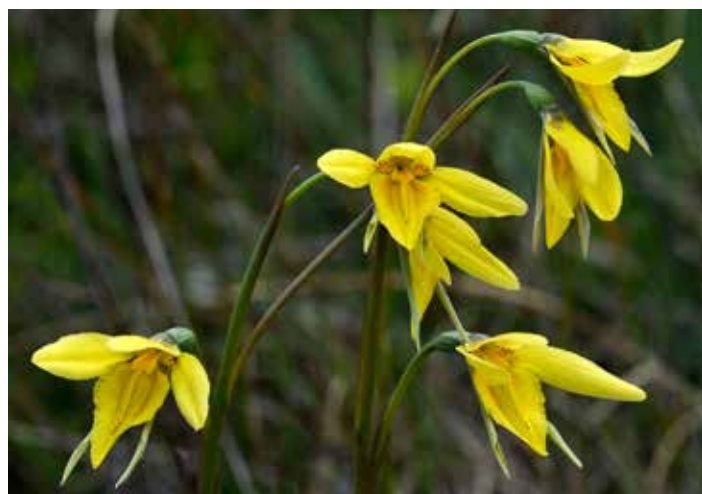
Diuris chryseopsis .

At one point the council wanted to turn the grasslands into a car park and "move it somewhere else" but community action saved the day. This area remains one of the best native grasslands in the Melbourne region with a number of state and federally listed rare plant species. Species present include Pelargonium rodneyanum , Arthropodium strictum , Stylidium graminifolium and many others including a variety of grasses such as Themeda triandra , Poa sieberiana and Dichanthium sericeum . A highlight is the reintroduction of the almost extinct Diuris fragrantissima and orchids such as Thelymitra arenaria and Diuris chryseopsis feature as well. Brunonia australis , Dillwynia cinerascens , and Stackhousia subterranea should be in flower.