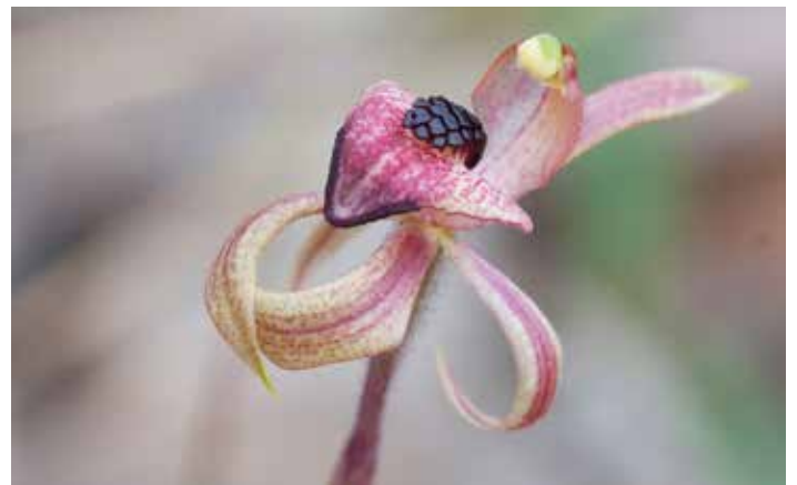
Caladenia cardiochila . Anglesea heathland.