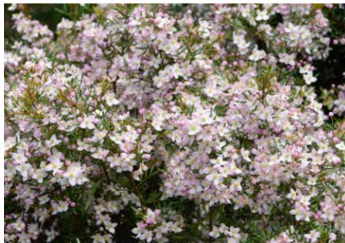
Boronia muelleri "Sunset Serenade".

Karwarra Australian Native Botanic Garden.