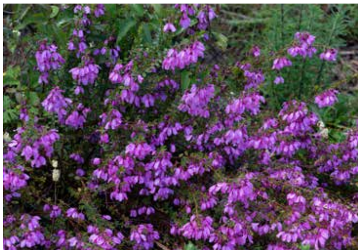
Tetratheca thymifolia .

Karwarra Australian Native Botanic Garden.