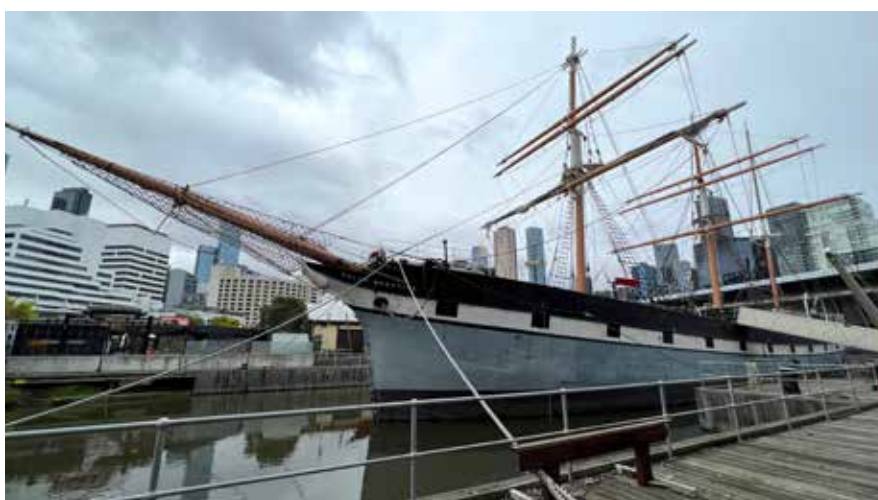
The Polly Woodside opposite the Melbourne Conference and Exhibition Centre.

Just a reminder that our conference venue is the Melbourne Conference and Exhibition Centre on the Yarra River which has top facilities with ready access to public transport, hotels and Air BnB accommodation. The venue is near wonderful galleries, exhibitions and the historic port area with the Polly Woodside (pictured) We will be seeking accommodation discount deals with hotels near the centre.