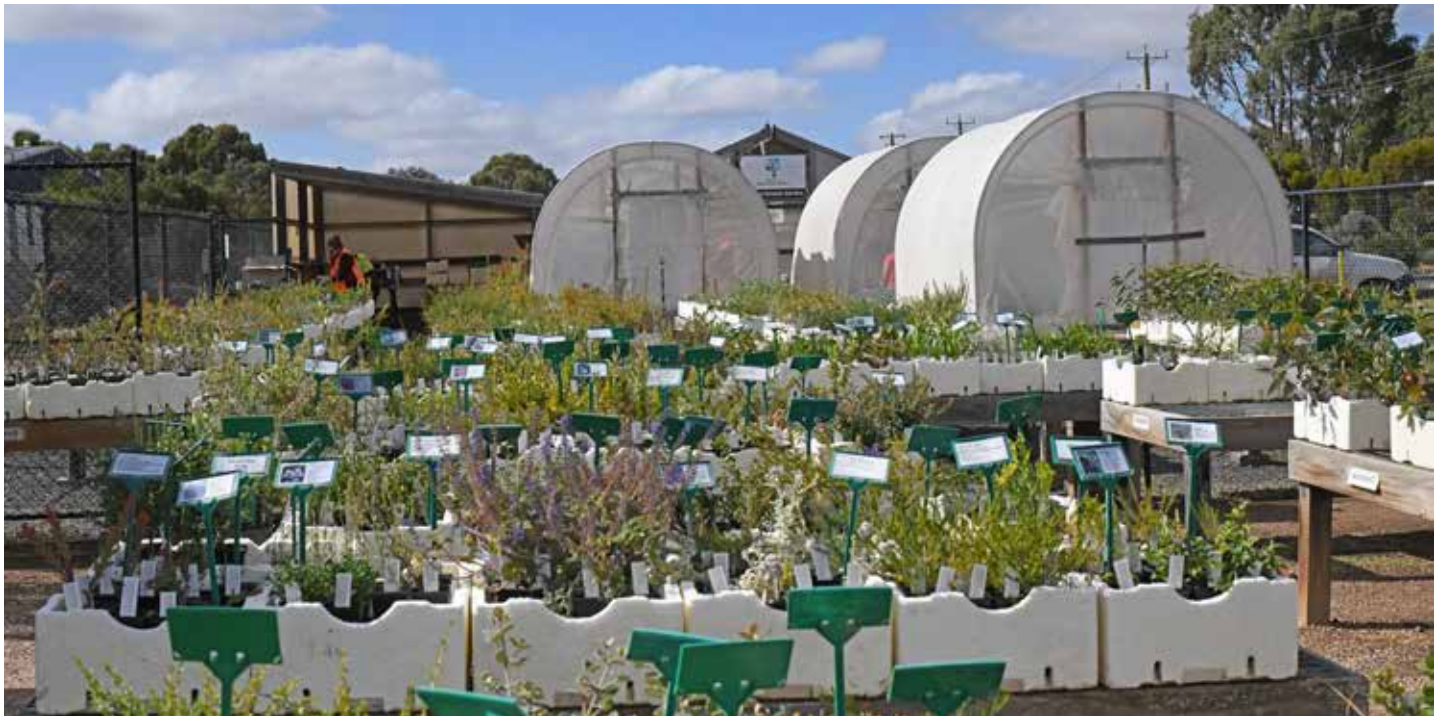
Friends of Melton Botanic Garden Nursery.