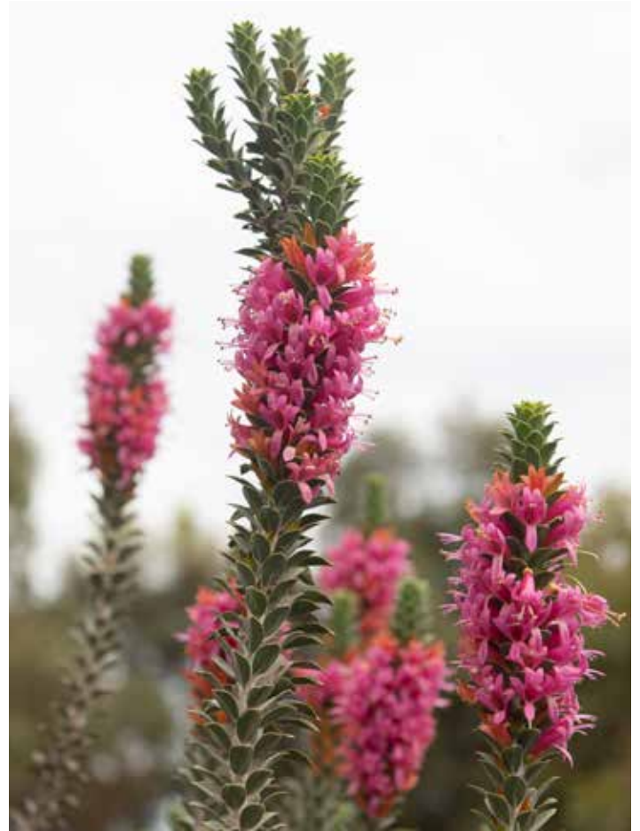
Above left: Melton Botanic Garden.