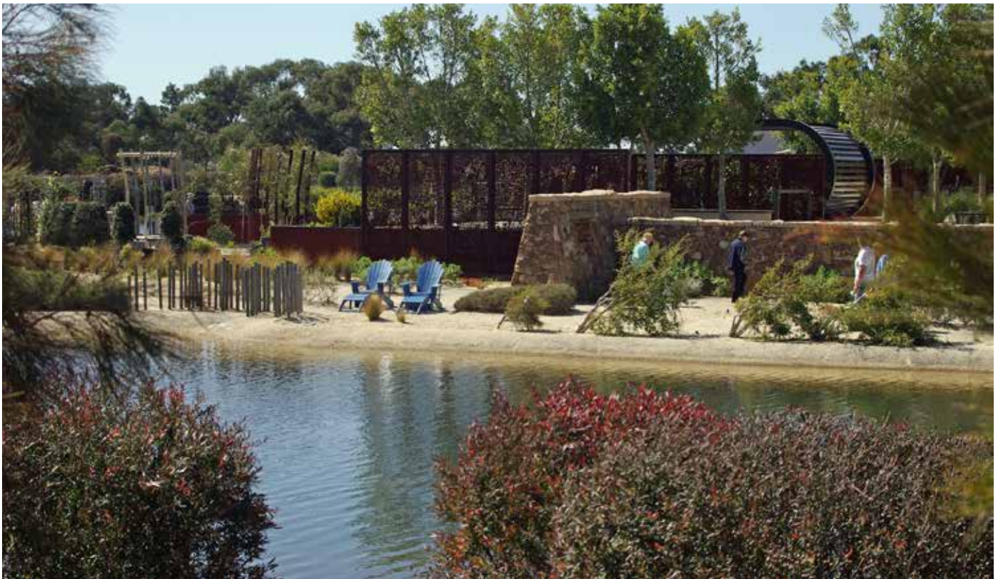
Australian Botanic Garden Cranbourne.

See page 7 for more information on the Langwarrin Flora and Fauna Reserve.