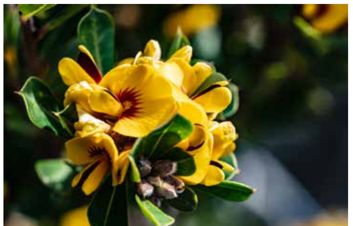
Pultenaea daphnoides . Anglesea heathland.

More detail and photos of this amazing new garden in future newsletters. Here is a link to check out the gardens development https://peopleandparks.org/project/chelsea-best-in-show-garden/