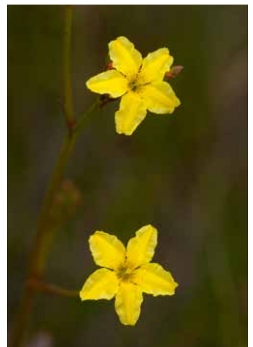
Ornduffia reniformis . LFFR.