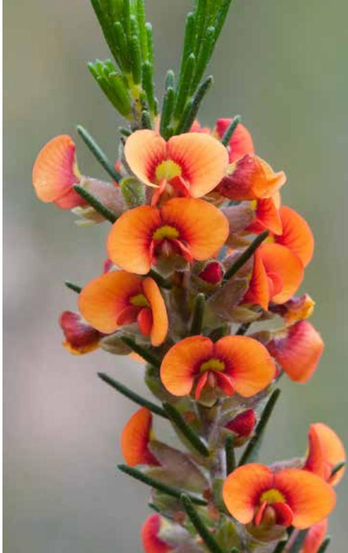
Dillwynia sericea . Anglesea heathland.

A world class wildflower area that is home to a quarter of Victoria's flora and over 100 species of orchids. The tour will be accompanied by a guide to find the most interesting flora.