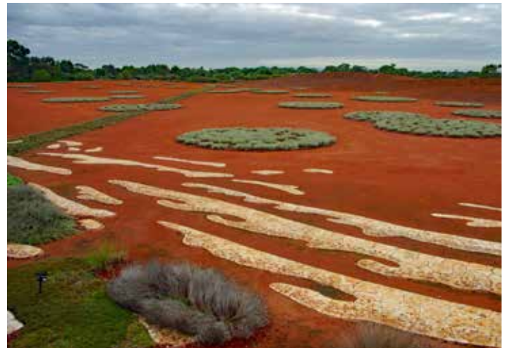
Desert Garden - Australian Botanic Garden Cranbourne.