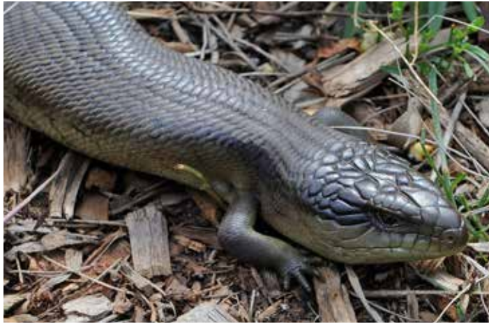
Blue-tongue Lizard in the garden.