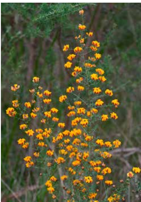
Pultenaea gunni . LFFR.

The reserve and surrounding lands were originally occupied by the Bunurong people who travelled across the peninsula in search of seasonally available foods. It was first established as the Langwarrin Military reserve in 1886 and during World War 1 German prisoners of war were detained at the reserve and a hospital was set up for the treatment of soldiers returning from France and Egypt. Luckily most of the natural vegetation remains!