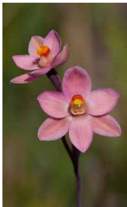
Thelymitra rubra . LFFR.