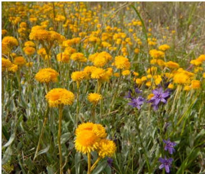
Chysocephalum apiculatum and Caesia sp. Sunbury Railway Remnant.

Rare Victorian plants and rainforest plants will feature as part of a guided tour of the Royal Melbourne Botanic Gardens. Then on to public parks such as Royal Park that have created indigenous gardens and grasslands to restore habitat and showcase Australian plants.