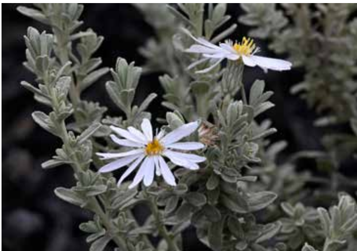
Olearia brevipedunculata in the Raising Rarity Garden, Australian Botanic Garden Cranbourne.