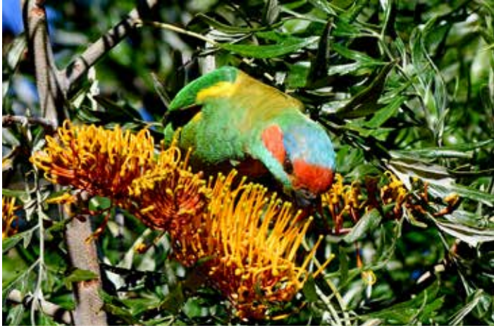
Musk Lorikeet feeding on the nectar of a Grevillea robusta flower.

A range of our very best private native gardens to showcase how you too can create a beautiful and biodiverse native garden.