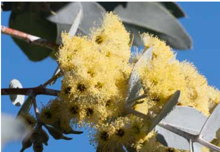
Above right: Eremophila calorhabdos . Melton Botanic Garden.

The Melton Botanic Garden is a popular place for walking and photography. The loop around the lake offers views of the lake and creek. There are many other paths which offer a variety of plants and views. Wildlife includes many birds, insects and frogs.