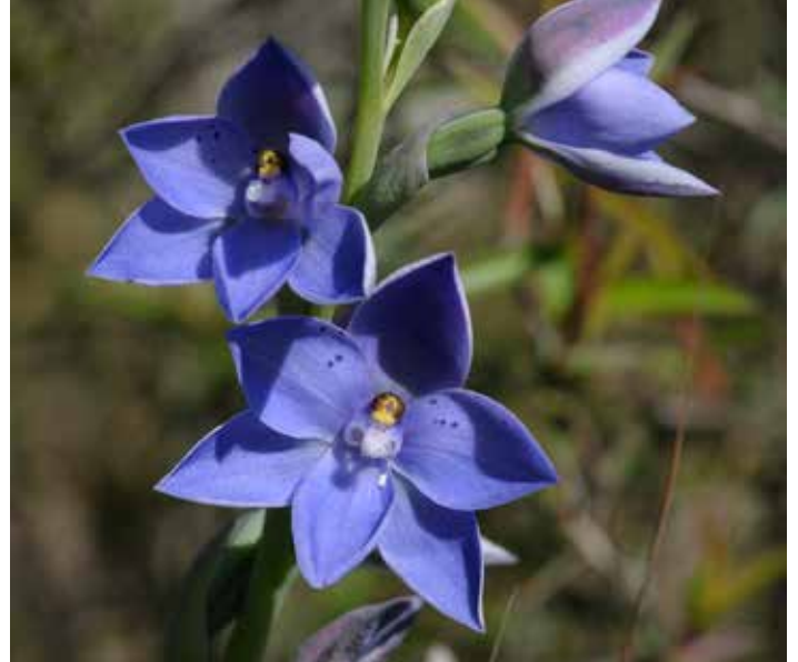
Thelymitra juncifolia . Anglesea heathland.