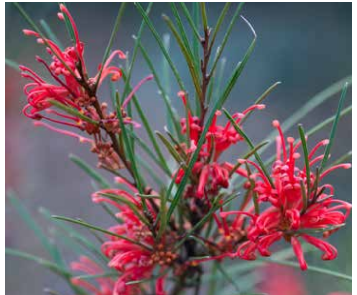
Grevillea dimorpha Flame Grevillea. Royal Melbourne Botanic Gardens.