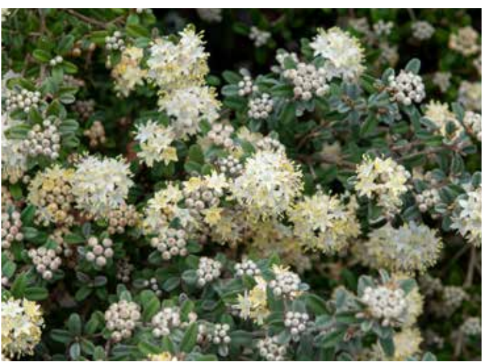
Phebalium squamulosum subsp argenteum.

Credit must be given to Kath Deery, a talented landscape designer, for the vision and early development of the gardens. This is a stroll garden with winding paths and raised garden beds. Ellis (Rocky) Stones, who