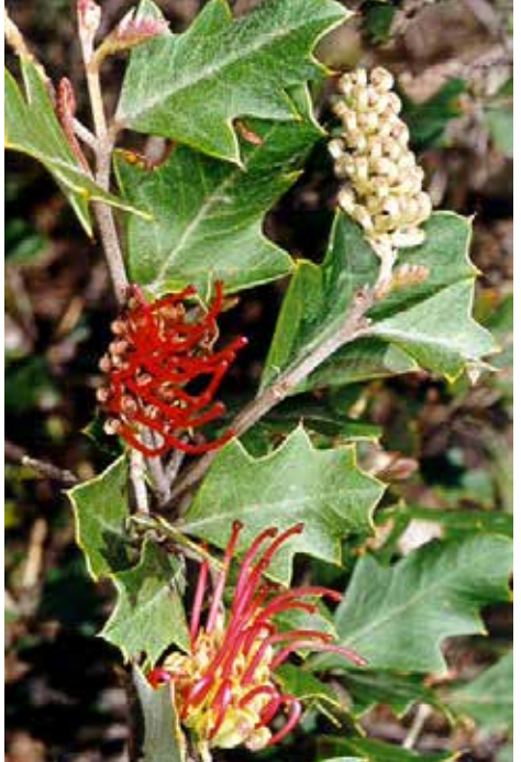
Grevillea infecunda , Anglesea Grevillea.