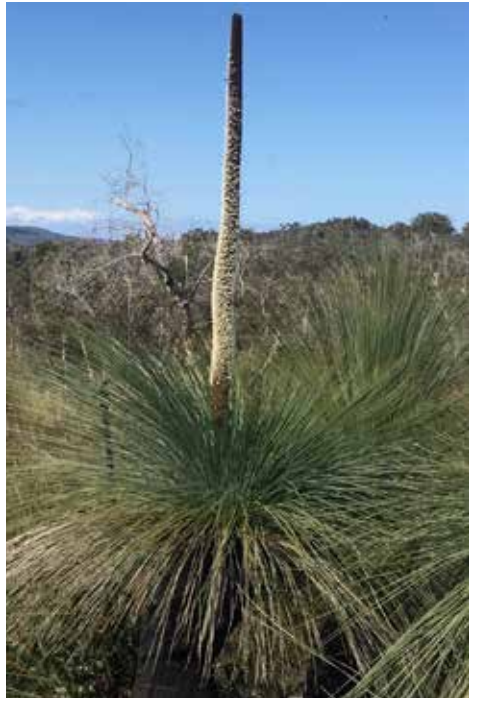
Xanthorrhoea australis, Austral Grass-tree.

It is also a hot spot for orchids with more than 100 species being recorded in the area, one of the most orchid rich areas in Australia. Here you can find greenhood orchids, helmet orchids, sun orchids and donkey orchids, with orchids to be found flowering throughout the year.