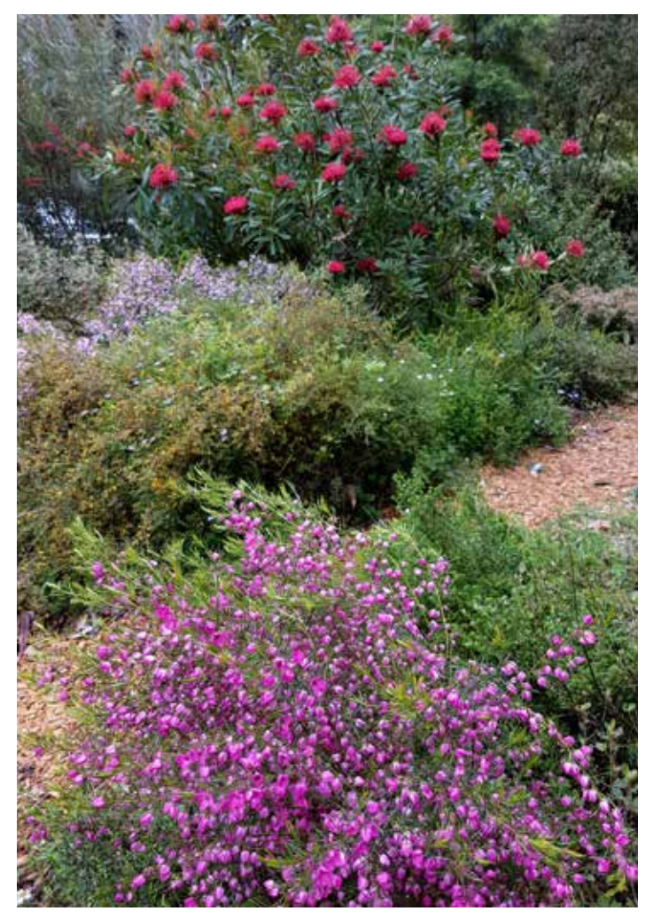
Karwarra Gardens featuring the Boronia and Telopea collections.