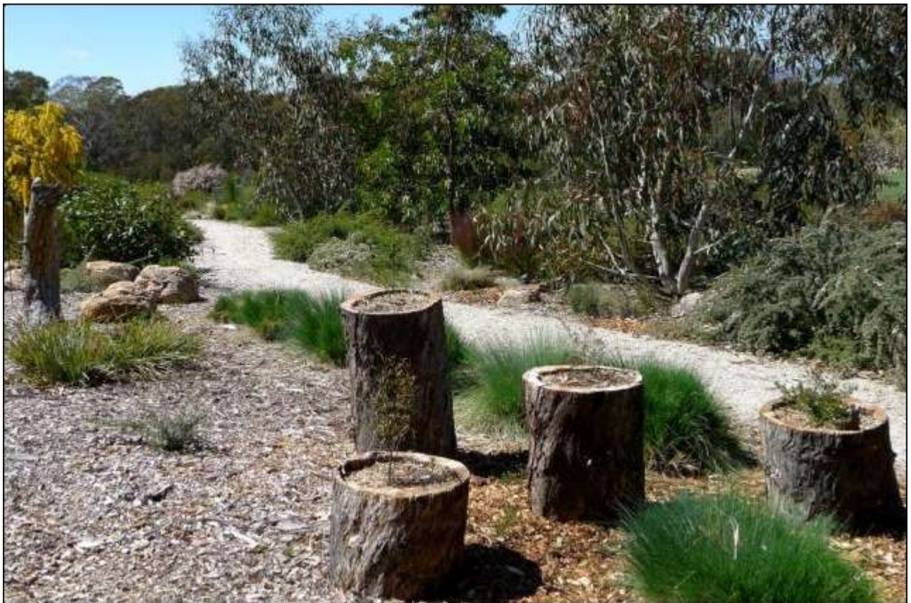
2012 spring. Pots and rocks on the 'bad' side of a path