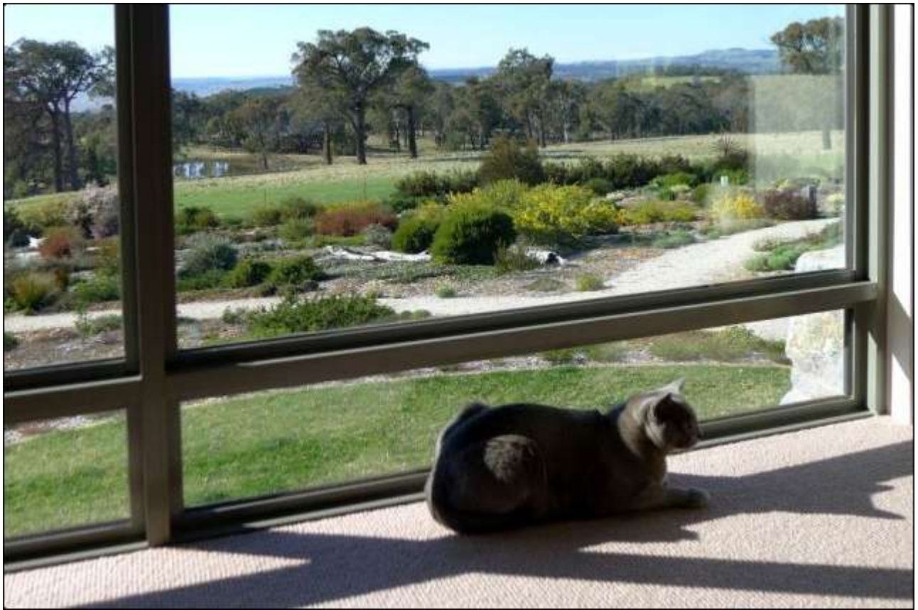
2012 spring. View south east from my favourite chair