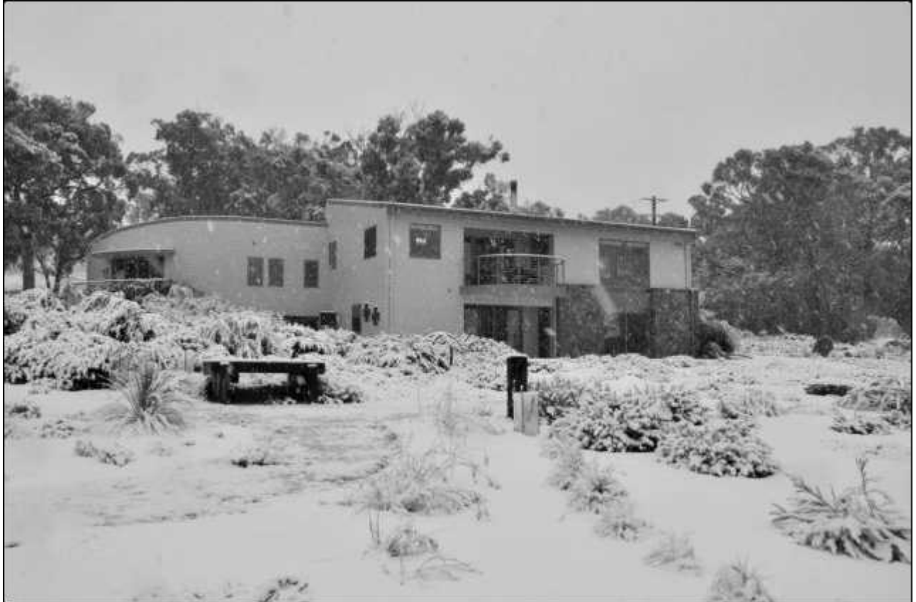
2011 winter. Kitchen light burning bright