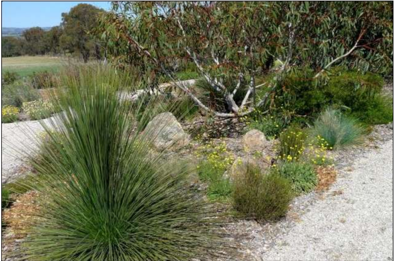
2012 spring. Favourite corner with snow gum, billy buttons and grass tree