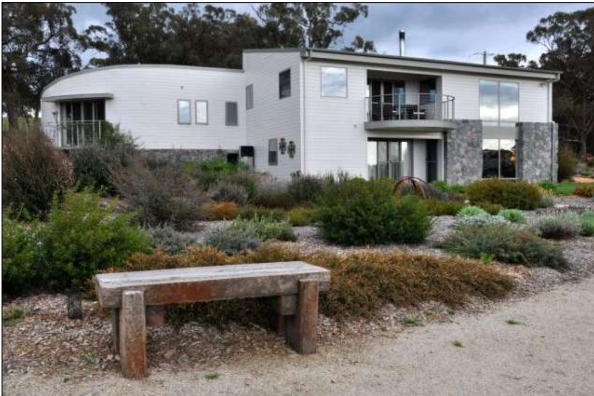
2010 - Very early spring