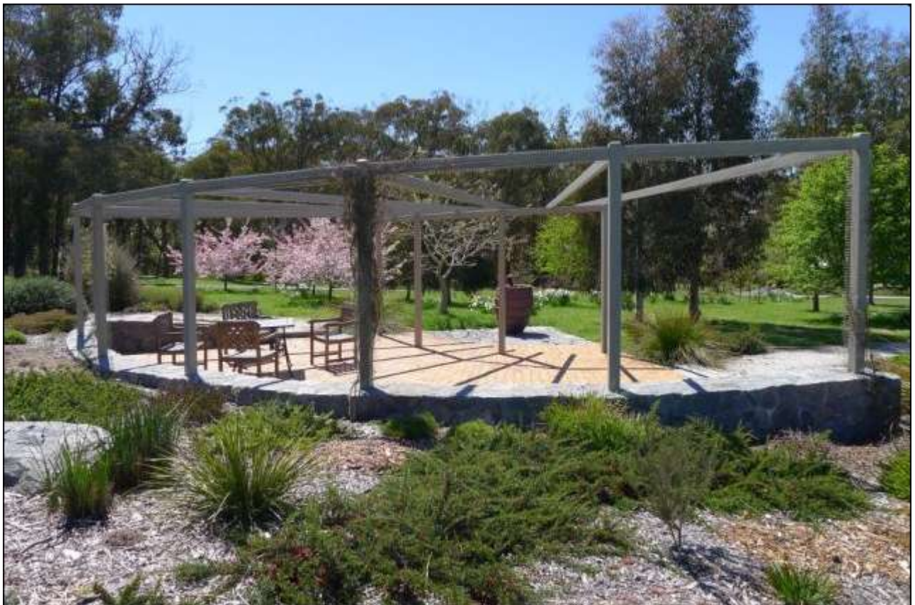
2012 spring. Looking through the Pavilion to crabapples in tree grove