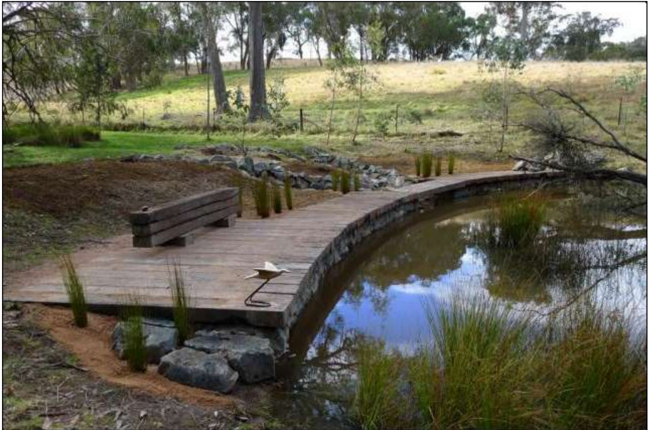
2012 winter. Landscaping the Secret dam. Three bridge sleepers awaiting placement