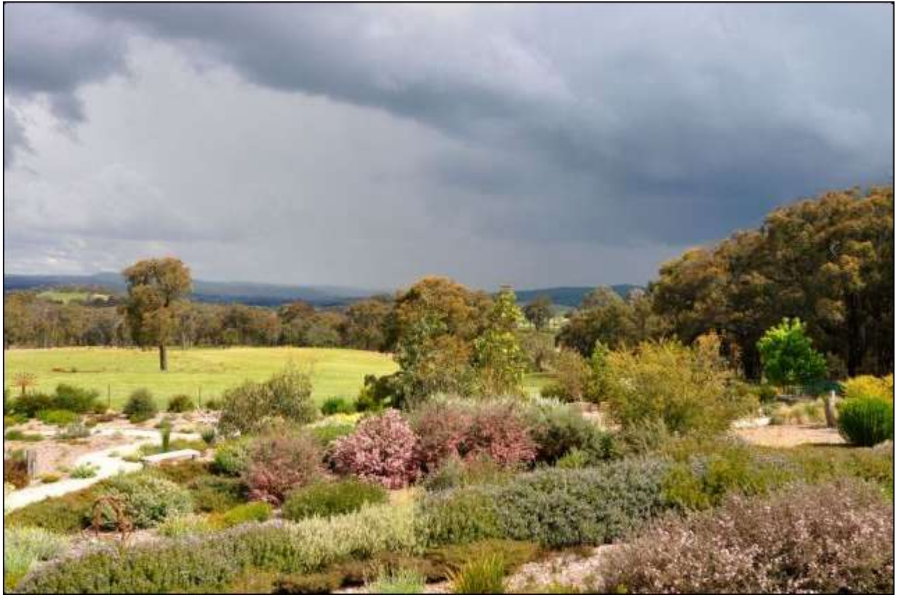
2010 - spring storm. Looking south