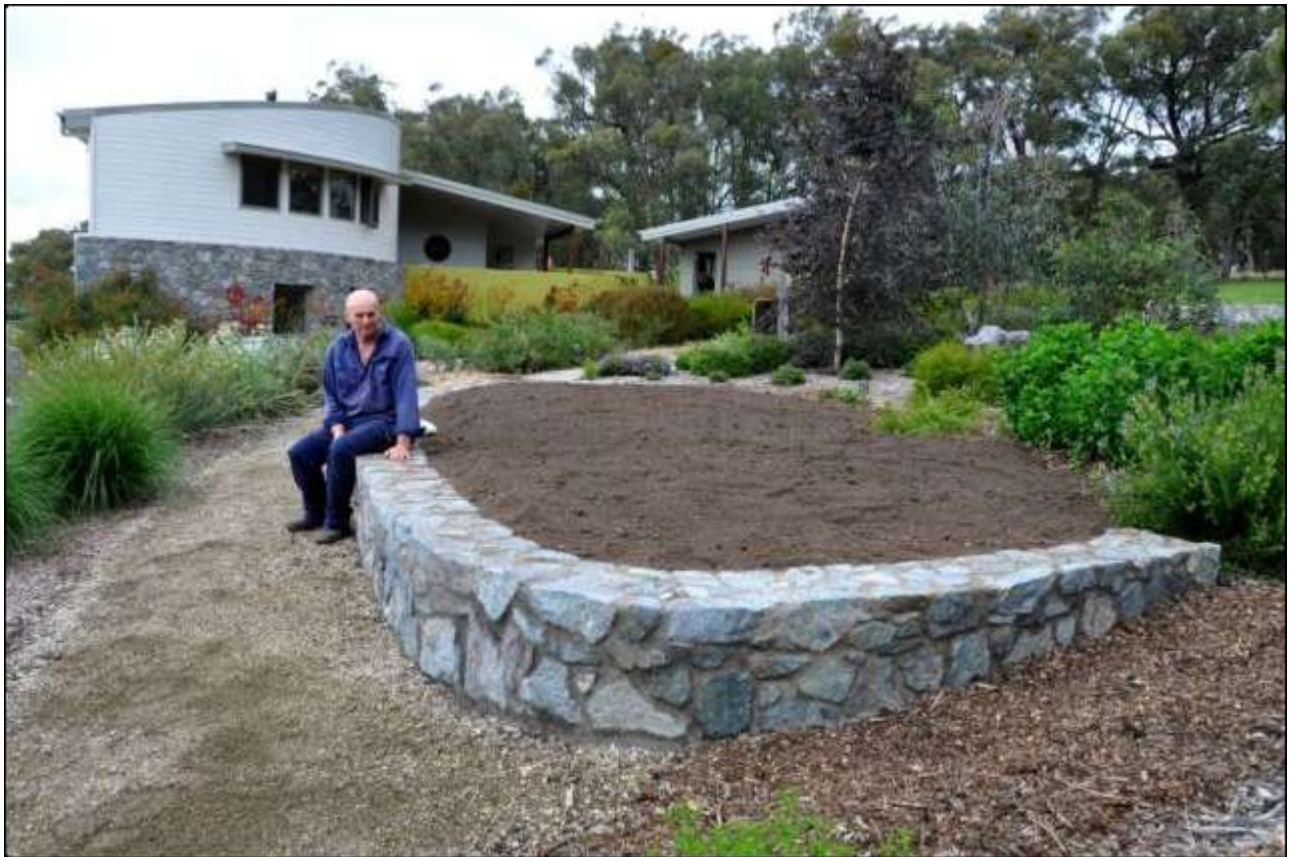
2011 spring. Terrace built to overcome waterlogging