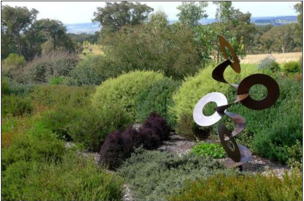
2012 autumn. Foliage tapestry