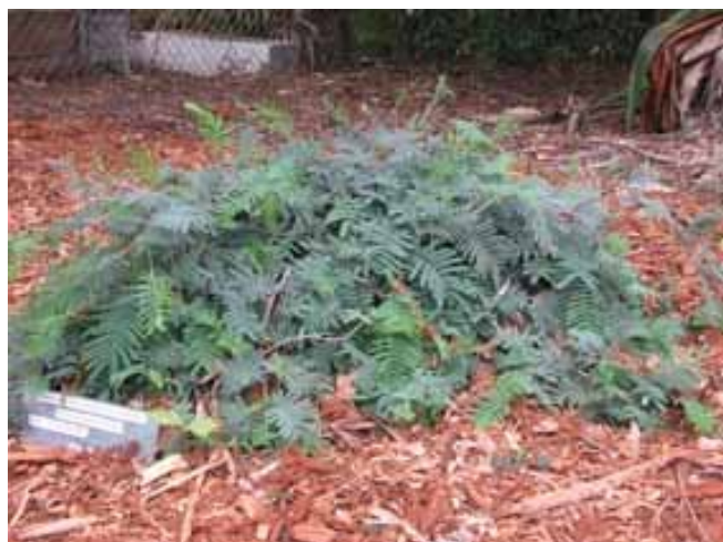
A low growing form of A. dealbata, at Maranoa Garden, Melbourne