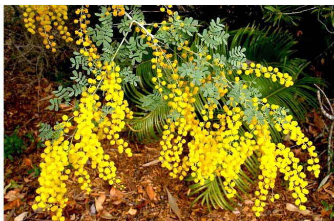
Acacia spectabilis

The above newsletter article immediately reminded me of several other acacias from the same area that have grown very well in Brisbane, in spite of the much higher humidity here. Another one from Auburn Road north of Chinchilla and other nearby areas is Acacia chinchillensis . A plant of this acacia flourished for over 10 years in my garden and produced seed prolifically so that I was able to give some to our Seed Curator regularly. It is a most attractive species with the dainty bipinnate leaves, even when not in flower.