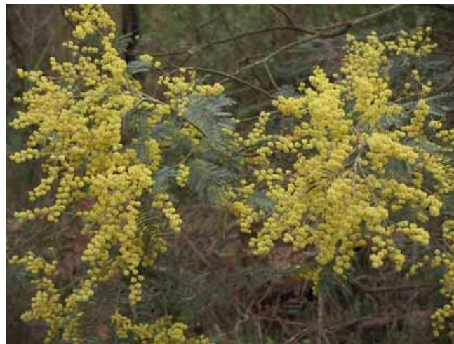
Acacia dealbata ssp. dealbata

The name dealbata indirectly refers to the whitish appearance of the branchlets and foliage. The leaves are mostly bluish grey green or silvery with young foliage being a soft velvety cream to golden colour. The flowers are highly perfumed ranging from yellow to bright yellow.