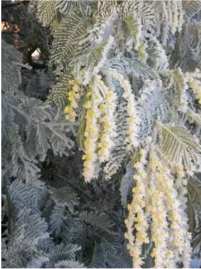
Acacia dealbata ssp. subalpina, flowers and frost Photo Liesbeth Uijtewaal-de Vries, taken in The Netherlands

Propagation is quite easy from seed immersed in boiling water to break seed dormancy and then sown into containers. Usually two seeds per container to thin out later and good success is even found in direct seeding.