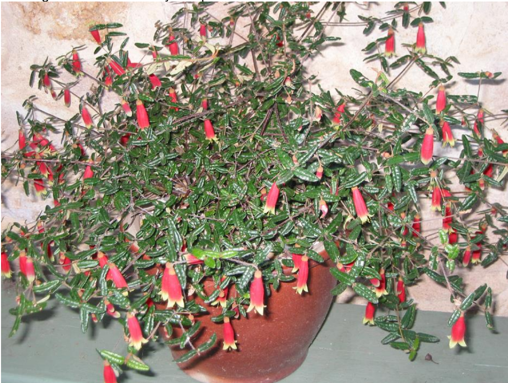
Correa reflexa "Fat Fred", flowers late in spring here, a real showstopper!

My own pots have suffered yet again for a second year. Last year I had two bad falls at work, which made working in the garden or with my pots very difficult, I was literally in maintenance mode, watering only, hoping to really get into things this year. Health is unpredictable, as many of you would know, and it was not to be. I had to cancel a visit from one of the SA Regional Groups as I felt the garden and pots weren't up to scratch, which was disappointing. No doubt when I am finally on top of things the really hot weather will have arrived, and all I'll do is water. I am looking forward to a healthy and productive autumn!