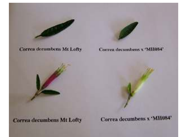
Comparator photo of MH084