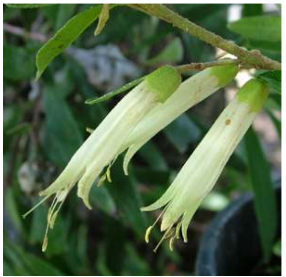
C.glabra MH0912 - cream coloured flower - attractive enough to earn a name and distribution.