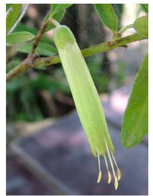
C. glabra MH083 - probably not worth naming or distributing

enthusiasts. The trade is full of new hybrids but usually only a handful are worthy of being named and distributed.