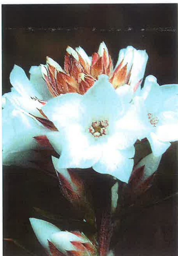
Photograph - Epacris grandis