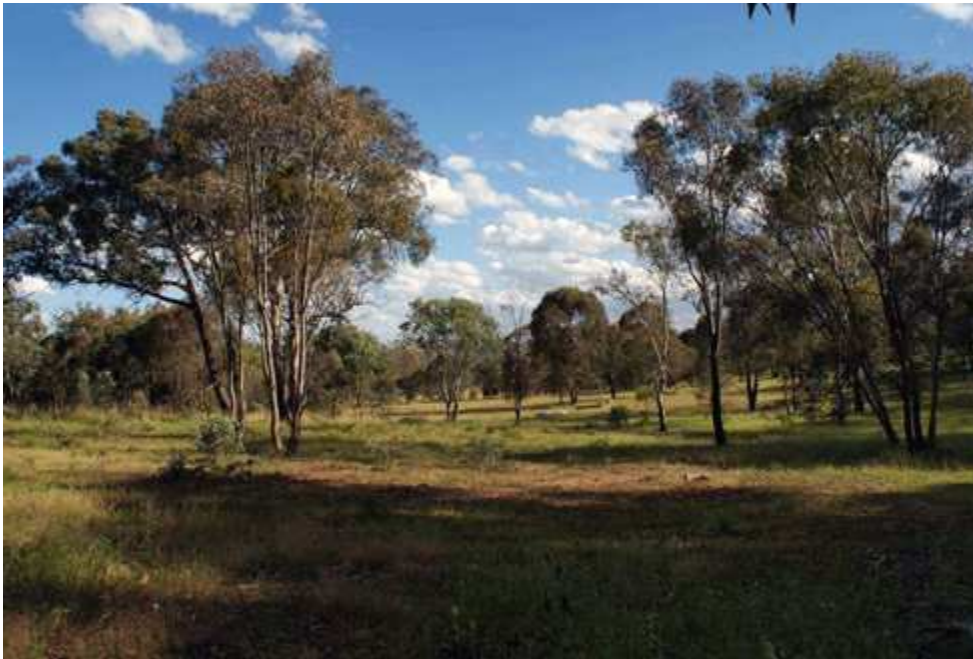
Box-Gum grassy woodland at Mulligans Flat on the outskirts of Canberra.

Box gum grassy woodlands are an iconic part of the eastern Australian landscape and once extended across large parts of inland south-eastern Australia. On trial sites on farmland in southern and central New South Wales, CSIRO is looking at ways of restoring these unique ecosystems to improve their resilience to a drying, warming climate.