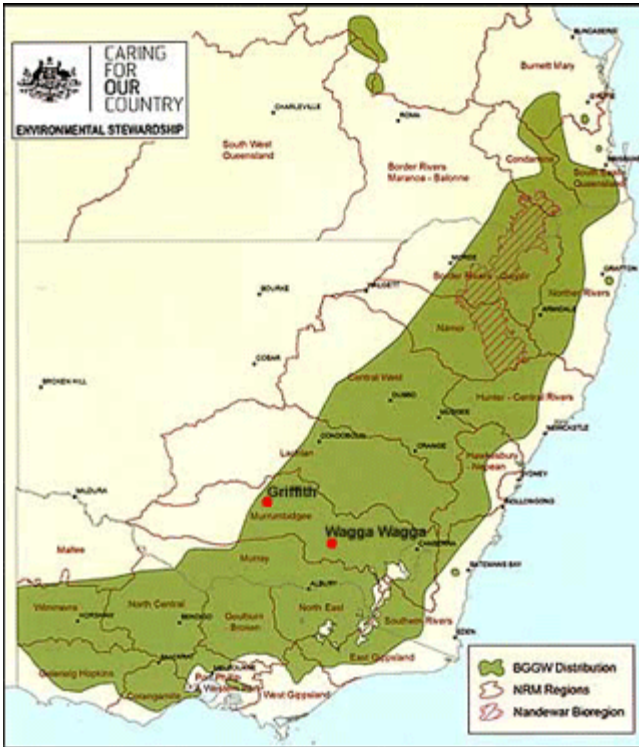
Historical distribution of box gum grassy woodlands across South Eastern Australia

However, the lower fertile foot slopes and flats that support these woodlands have also been the areas preferred for cropping, pasture, and infrastructure development. Widespread clearing, grazing, cultivation and fertiliser application have resulted in box gum grassy woodlands being nationally listed as an endangered ecological community.