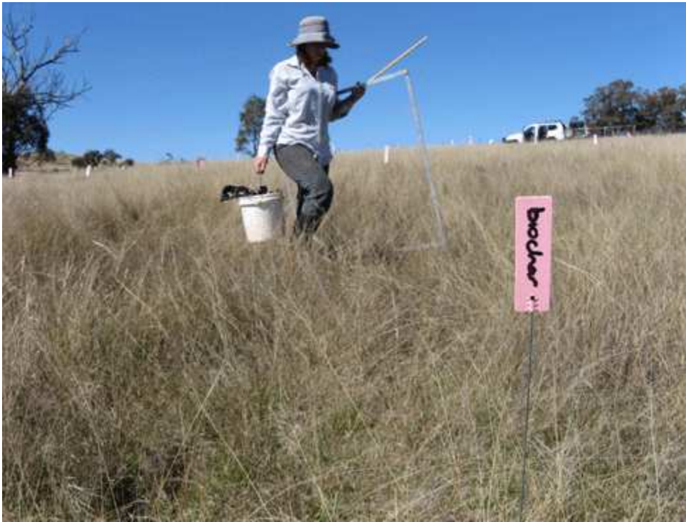
A member of the project team sows Eucalyptus melliodora seeds, Binalong, 2011.