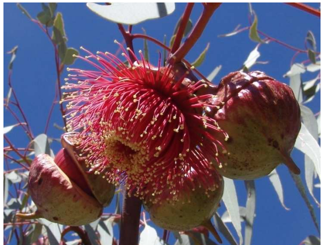
The tall peaked buds of E. youngiana and more normal rounded bud caps with red flower form.