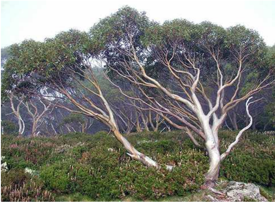
Snow gum ( Eucalyptus pauciflora ): Different eucalypt species have adapted to diverse environments across Australia. How will current species distributions respond to climate change?