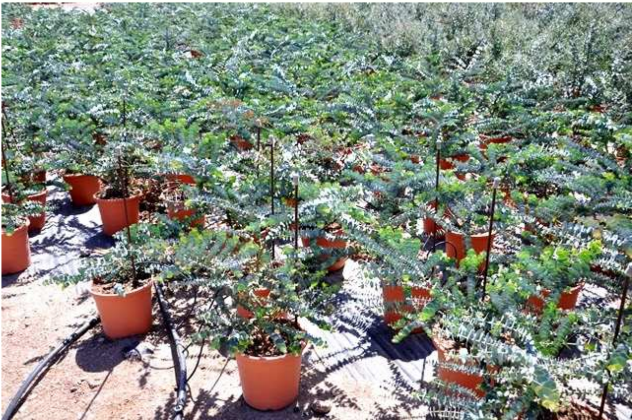
Eucalyptus 'Little Boy Blue' in Spain

And the species, Eucalyptus pulverulenta , was featured recently on the Facebook page of the Australian Seed Bank Partnership, a national effort to conserve Australia's flora through seed collecting, banking, research and knowledge. On 13 May 2014 they excitedly informed their Facebook friends that seed from a natural population had been collected and stored.