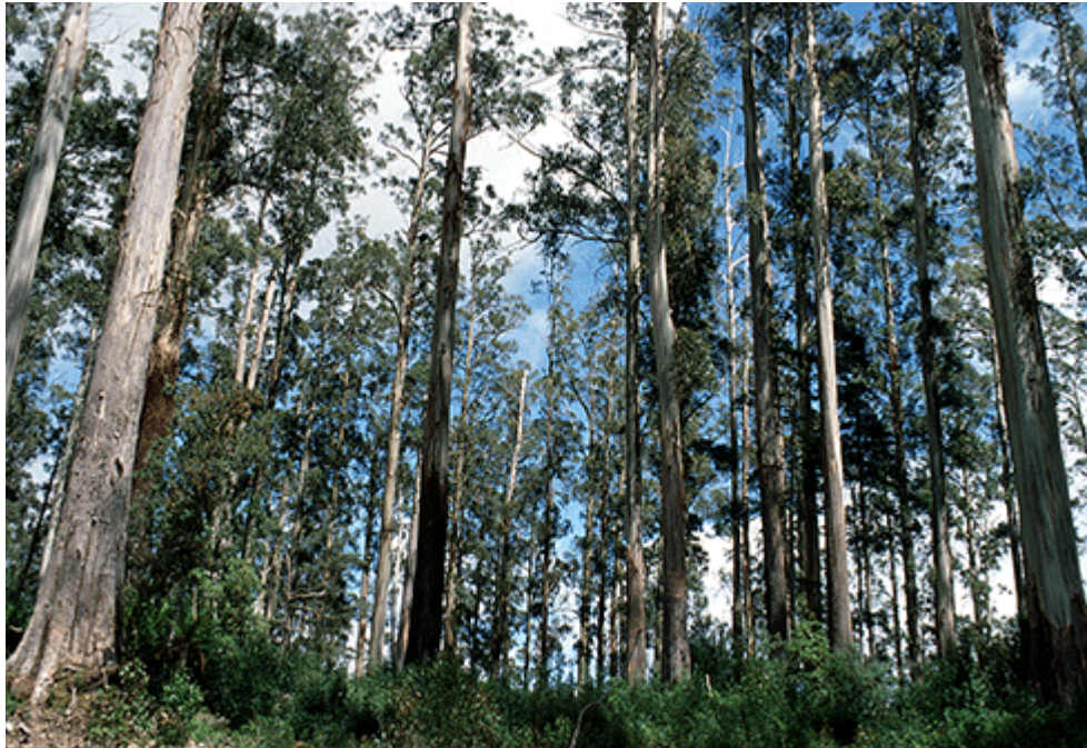
Mountain ash forest, Tasmania

Old trees contribute more to carbon storage than previously thought in a new international study that included Australian researchers.