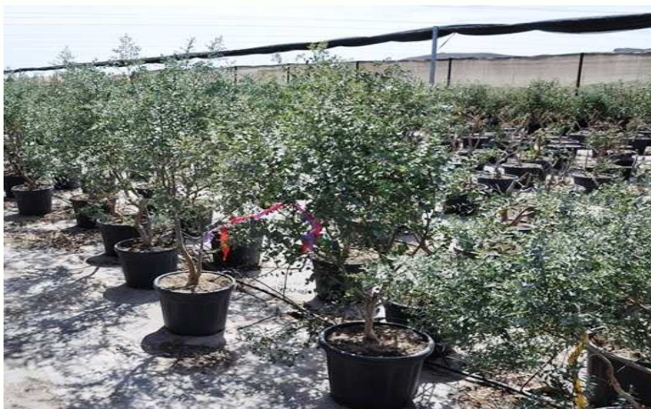
Eucalyptus gunnii in Spain

European settlers in Tasmania would tap Cider Gum like you would a Maple, to extract the sap from its trunk. Fermentation turned it into what has been described as a ‘cider-like drink’. I suspect this means it has alcohol in it and tastes more like an apple than hops, barley or molasses. I think beer and rum were the other popular drinks of the time.