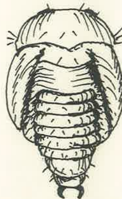
Pupa of the Staghorn fern Beetle