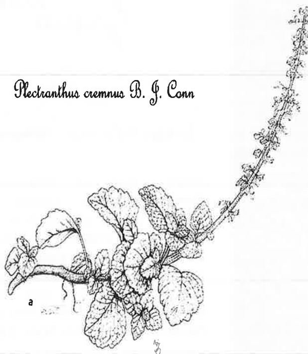
Plectranthus cremnus B. J. Conn

If anyone would like material or seedlings of this very beautiful plant please call in or write for some.