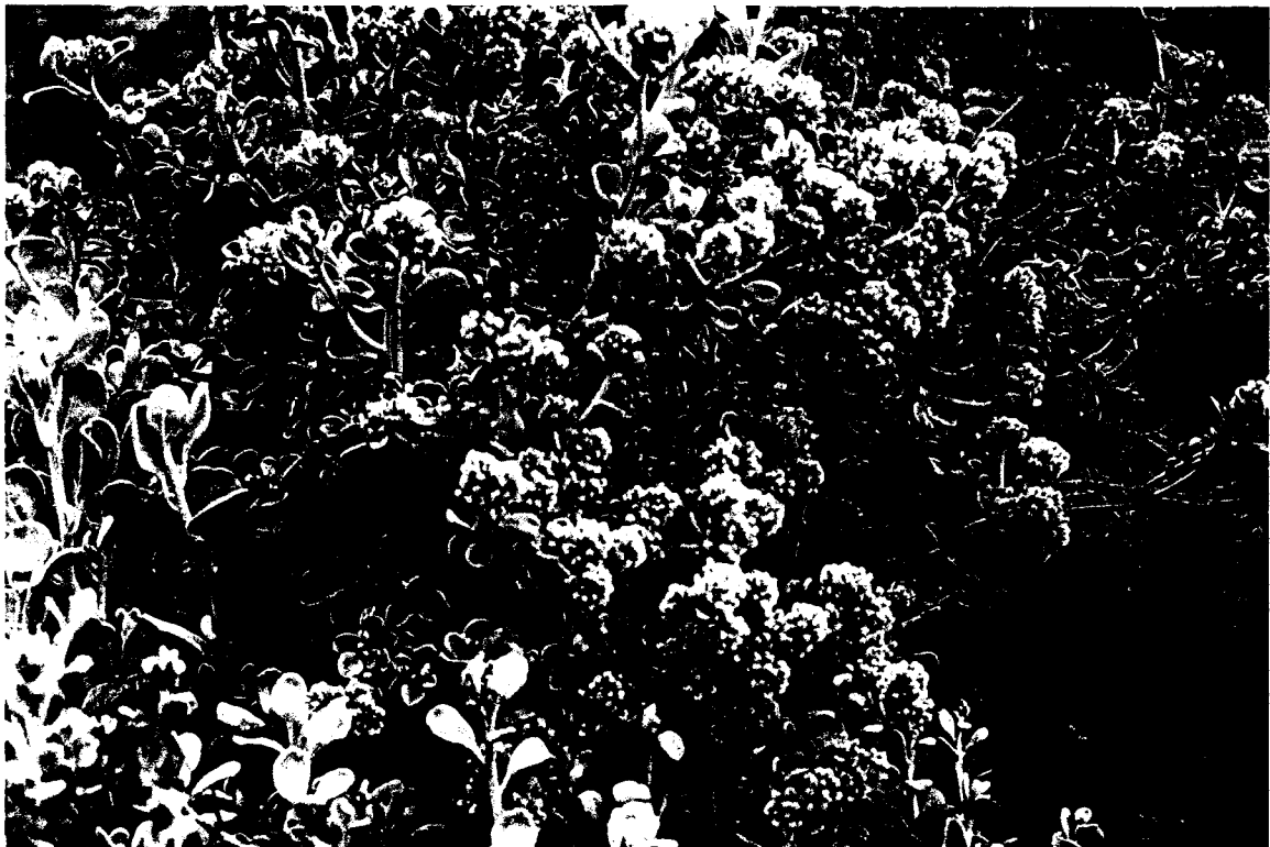
Below: Ptilotus obovatus .