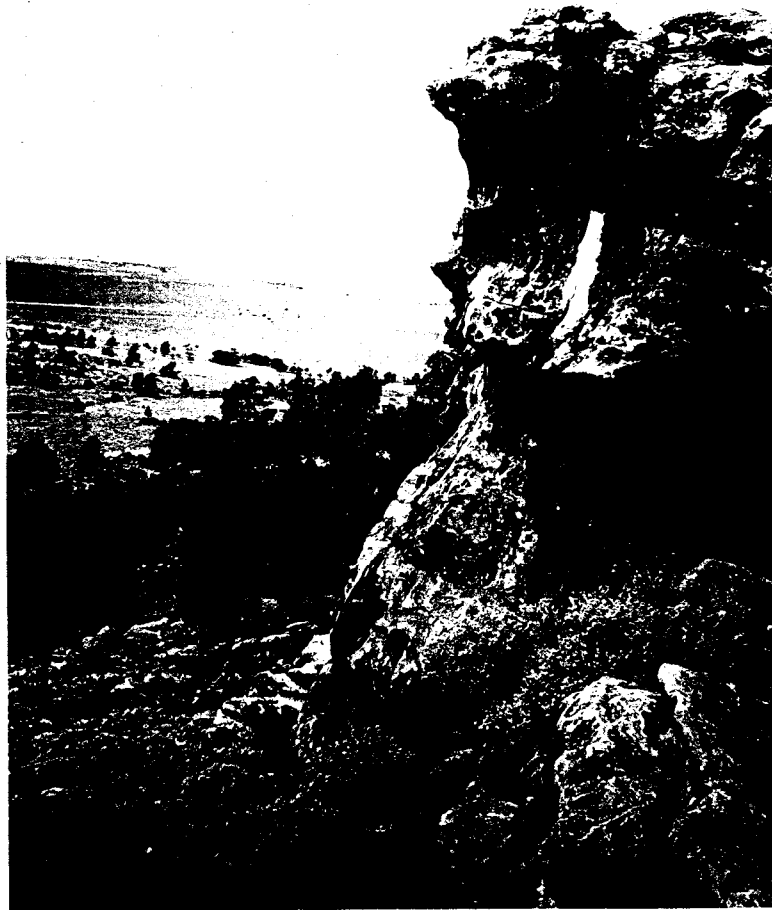
Above: Ptilotus obovatus growing at the foot of the cliff, Yourambulla Caves, Just Hawker, S.A.