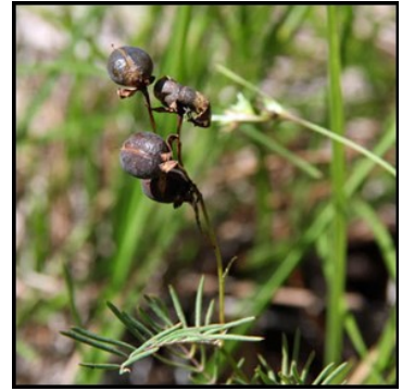
Gompholobium pinnatum pods