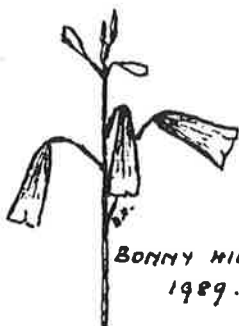
BONNY MILLS 1989.