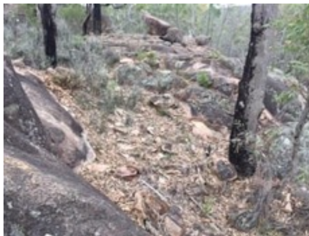
Actinotus helianthi habitat