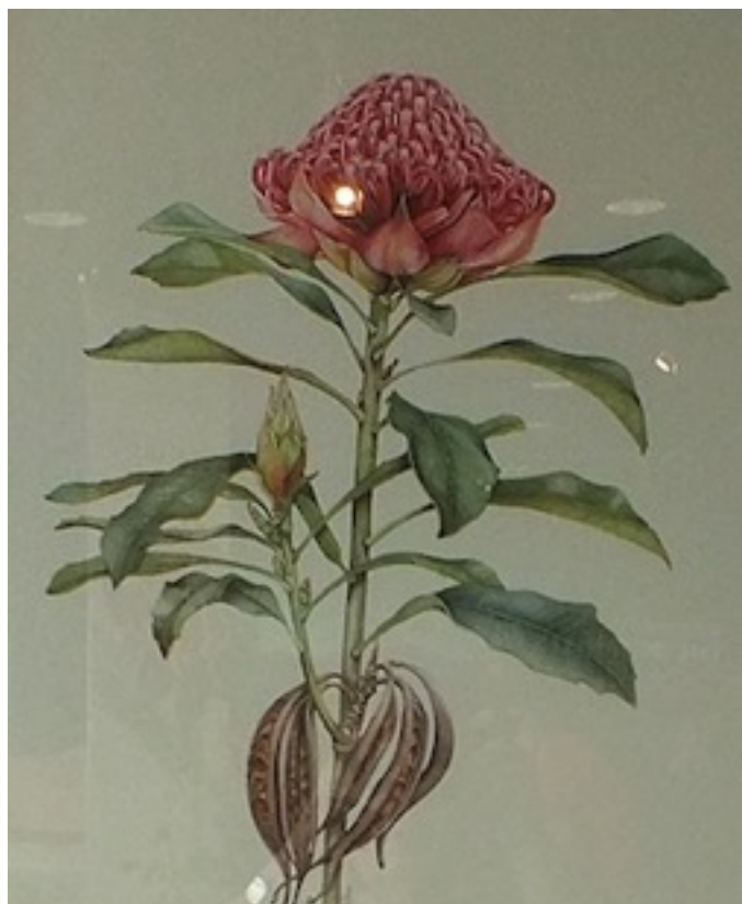
Waratah painting at Mt Tomah BG - artist not named

New Website Bookmark it today! waratahflannelflowersg.weebly.com