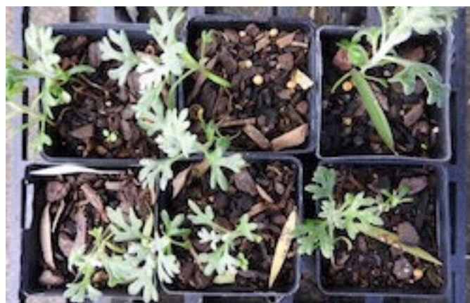
Seedlings all potted on in tubes.

I have grown these Actinotus by using the pictured butane gas blower. I scraped away the leaves from a metre of ground, put out the seeds as evenly as I could, replaced the leaves, started the flame and burned away the litter to bare soil. Two months or so later up came a few tiny plants. They are easy to pot up at the three leaf stage. You can see by the pictures I have them in pots and have also left some in the ground. All the plants in the pots are much larger.