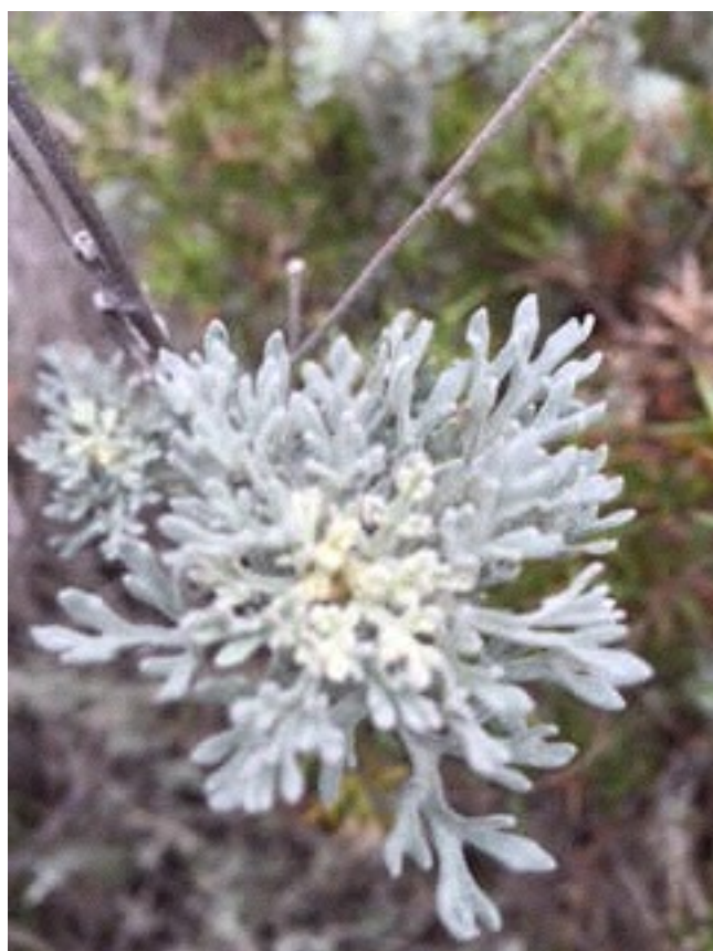
Actinotus helianthi Gilgai form foliage

Actinotus helianthi grows on the side of granite outcrops on the north west slopes and Tablelands. It has a shorter growing season and smaller flowers than the coastal forms but may be more drought hardy.