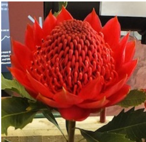
2. Cultivar Winner - Sunburst - Col Terry