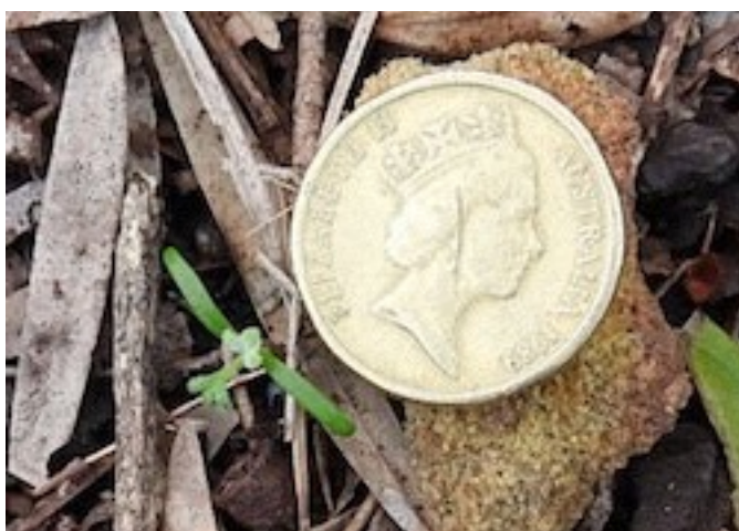
Seedling emerges after firing with a blowtorch.

This is the way I grow Flannel Flowers in pots. I use a ceramic tub which is elevated on bricks or a stand to allow free drainage. Add some gravel to the bottom of the pot before filling with native potting mix. Plant three small plants in the top spaced evenly. Then cover the surface with small white gravel which will reflect sunlight to the flowers. Add a sculpture if you want. The variety below is one of the dwarf forms from Margaret Guenzel.