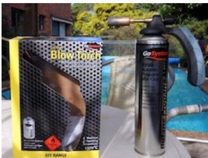
Blowtorch used in the experiment