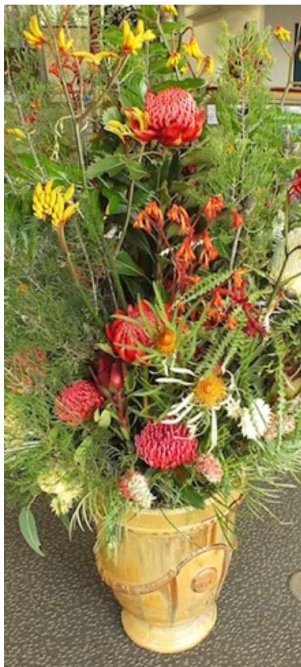
One of the arrangements at the Waratah festival at Mt Tomah