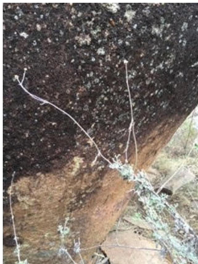
Actinotus helianthi Gilgai form foliage showing the long spindly flower stalks held clear of the foliage.